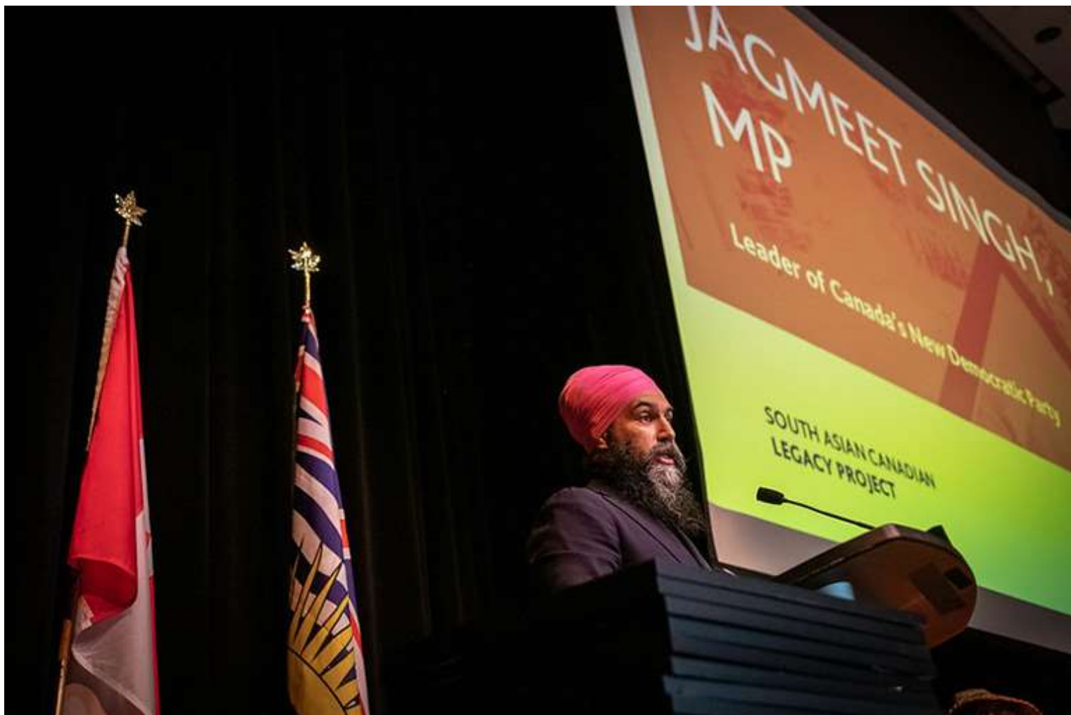
Jagmeet Singh, leader of the NDP Party, spoke at the SACLP launch event.

SACLP received funding of $1.14 million dollars in March 2020 from the Province of British Columbia and from the Abbotsford Community Foundation. The project partners with the Royal BC Museum, the BC Labour Heritage Centre and Open School BC.